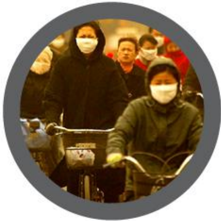
URBAN AIR POLLUTION